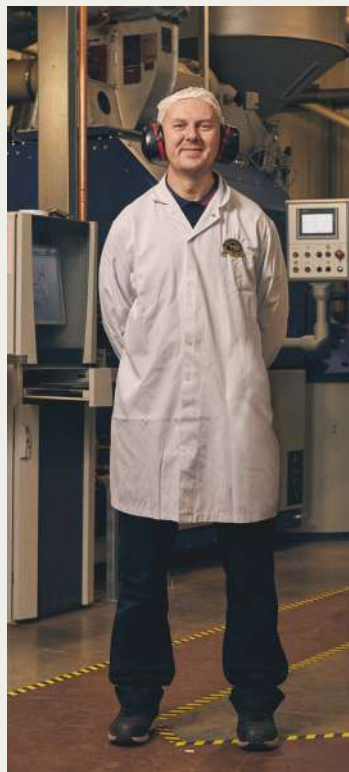
In house Q-grader