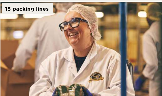
15 packing lines