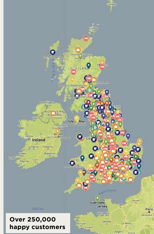
Over 250,000 happy customers