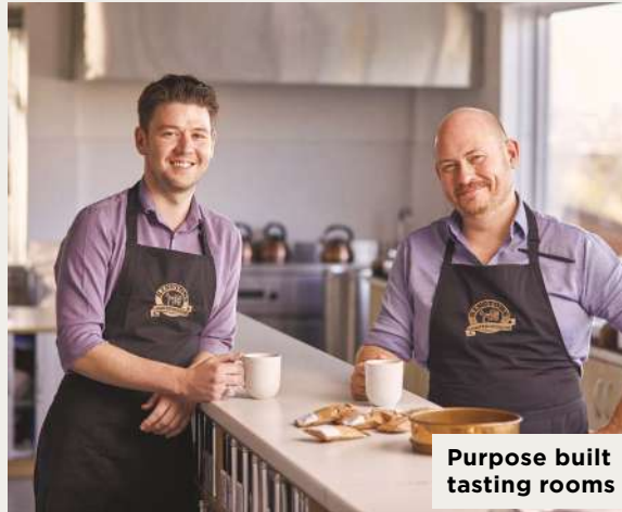
Purpose built tasting rooms