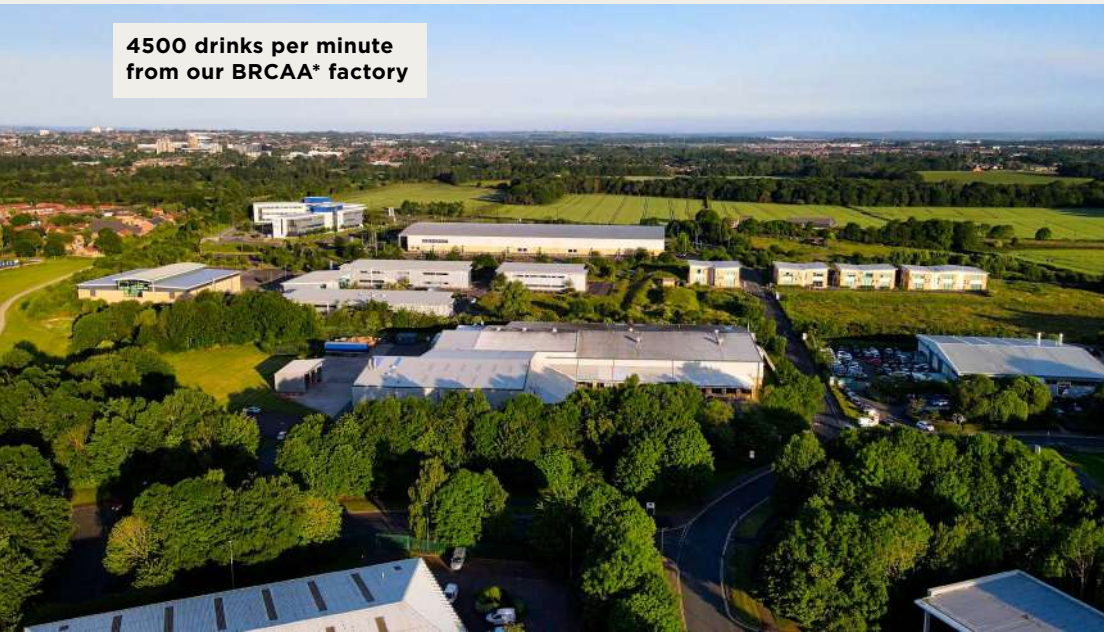
4500 drinks per minute from our BRCAA* factory