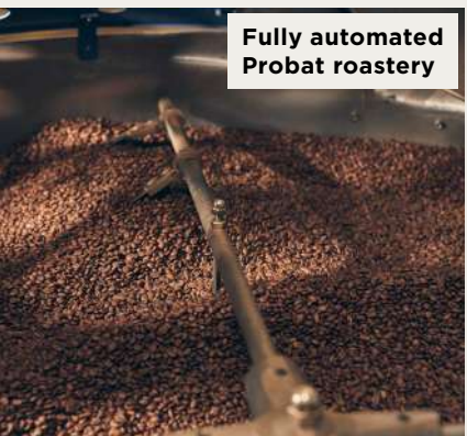
Fully automated Probat roastery